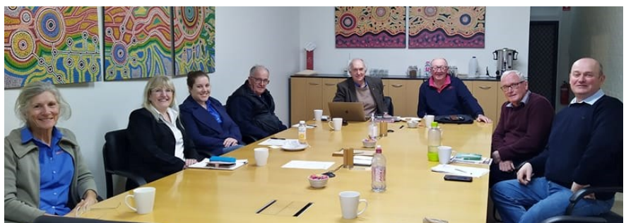
Round table Foundation Broken Hill June Board Meeting

The current Board includes a mix of more recent and long-term members—some for more than 22 years and others beginning only this year. ■