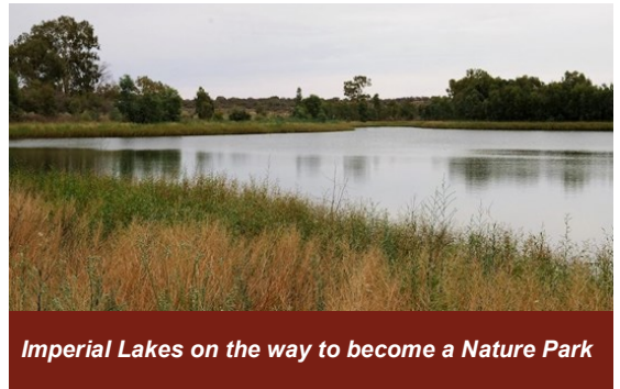
Imperial Lakes on the way to become a Nature Park

The issue of who owns the land has been resolved, the decommissioning of the dam is being finalised and Landcare has engaged legal, financial, cultural and environmental experts to ensure their exciting plans for the area to transform into a sensational Nature