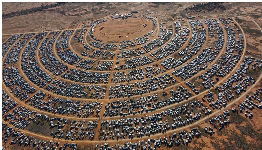
Thousands of campers on the Mundi Mundi plains in a spectacular inaugural event

Check out the website and purchase tickets at: www.mundimundibash.com.au/aug2022 ■