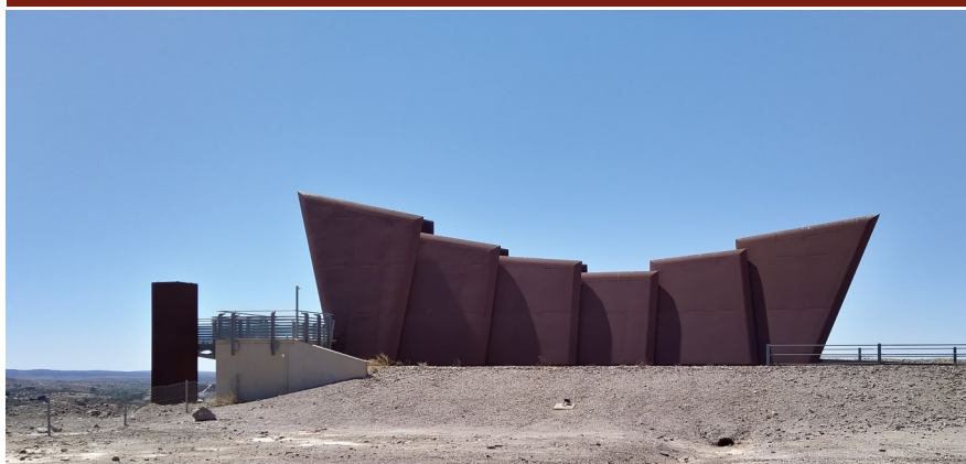
Miners Memorial, Broken Hill