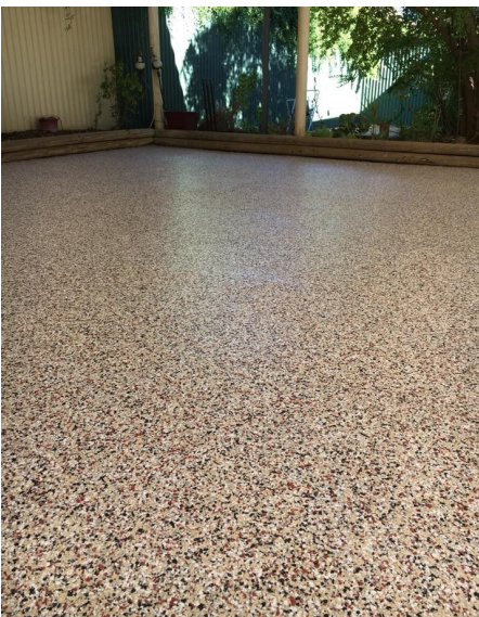
A decorative and safe upgrade to a tired outdoor area from YourWay Coatings

YourWay Coatings is the most recent of our project clients to complete repayment of its interest-free start-up loan.