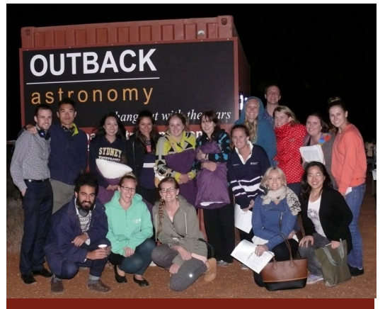
A group of students at an earlier star gazing event.

One of Foundation Broken Hill's favourite tourism support projects has just been recognised as one of Australia's best tourism attractions.